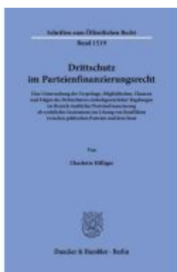
Drittschutz im Parteienfinanzierungsrecht. Ladenpreis: 82,20EUR