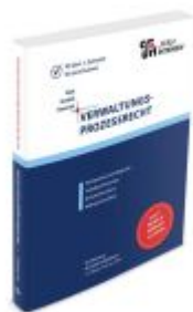
Verwaltungsprozessrecht Ladenpreis: 32,80EUR