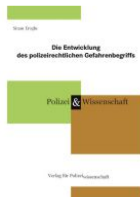
Die Entwicklung des polizeirechtlichen Gefahrenbegriffs Ladenpreis: 27,70EUR