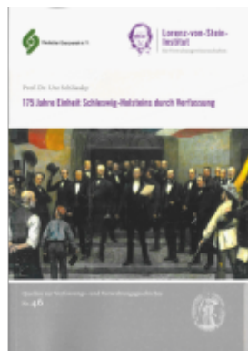
175 Jahre Einheit Schleswig-Holsteins durch Verfassung Ladenpreis: 15,40EUR