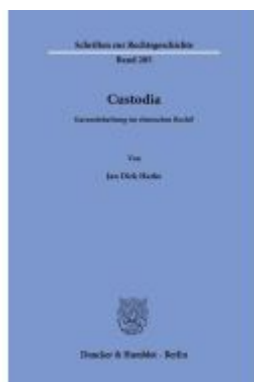
Custodia. Ladenpreis: 71,90EUR