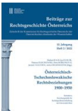
Beiträge zur Rechtsgeschichte Österreichs, 12. Jahrgang, Heft 2/2022 Ladenpreis: 49,00EUR