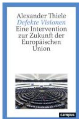
Defekte Visionen Ladenpreis: 22,70EUR

Wir haben andere Produkte gefunden, die Ihnen gefallen könnten!