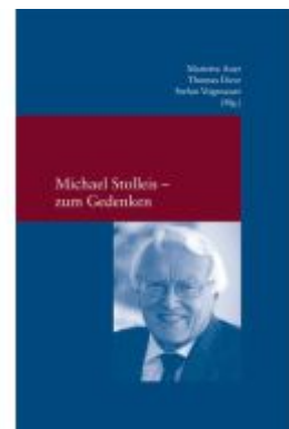
Michael Stolleis – zum Gedenken Ladenpreis: 22,70EUR