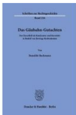
Das Gäubahn-Gutachten. Ladenpreis: 102,70EUR