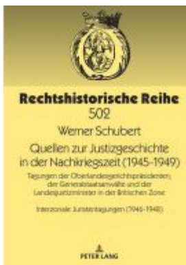
Quellen zur Justizgeschichte in der Nachkriegszeit (1945-1949) Ladenpreis: 113,10EUR