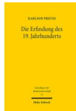
Die Erfindung des 19. Jahrhunderts Ladenpreis: 91,50EUR