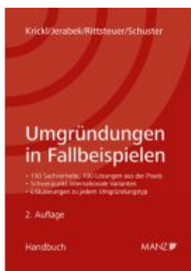
Umgründungen in Fallbeispielen Ladenpreis: 74,00EUR

Mónica Liliana Bográn-Pagán Configuración Jurídica de las Public Private Partnerships (PPP) en el ámbito del suministro de energía ¿Qué puede aprender Colombia del Derecho Alemán?