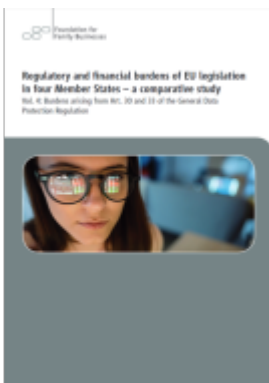
Regulatory and financial burdens of EU legislation in four Member States - a comparative study Ladenpreis: 41,10EUR