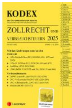
KODEX Zollrecht 2025 - inkl. App Ladenpreis: 119,00EUR