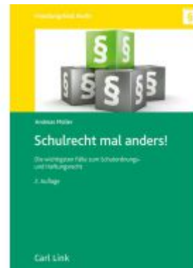
Schulrecht mal anders! Ladenpreis: 40,10EUR