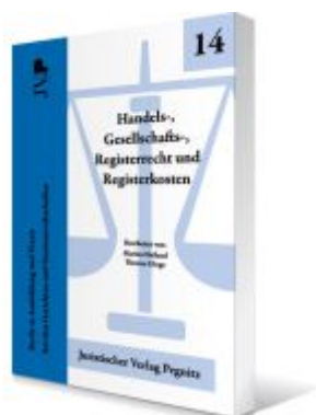
Handels-, Gesellschafts-, Registerrecht und Registerkosten Ladenpreis: 25,70EUR