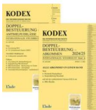
KODEX Doppelbesteuerung 2024/25 Ladenpreis: 73,00EUR