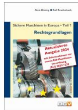
Sichere Maschinen in Europa - Teil 1 - Rechtsgrundlagen Ladenpreis: 17,30EUR