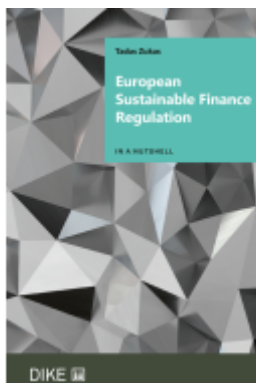
European Sustainable Finance Regulation Ladenpreis: 64,00EUR