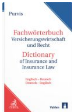
Fachwörterbuch Versicherungswirtschaft und Recht = Dictionary of Insurance and Insurance Law Ladenpreis: 189,00EUR