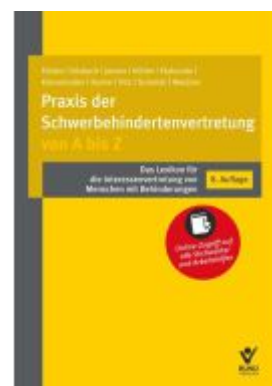
Praxis der Schwerbehindertenvertretung von A bis Z Ladenpreis: 65,80EUR