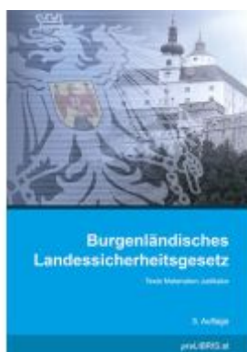
Burgenländisches Landessicherheitsgesetz Ladenpreis: 11,00EUR