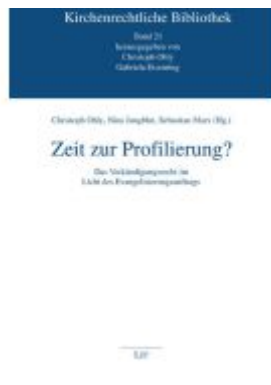
Zeit zur Profilierung? Ladenpreis: 24,90EUR