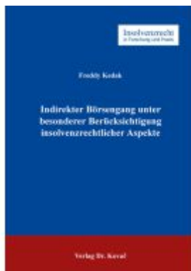
Indirekter Börsengang unter besonderer Berücksichtigung insolvenzrechtlicher Aspekte Ladenpreis: 101,60EUR