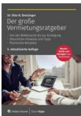
Der große Vermietungsratgeber Ladenpreis: 29,99EUR