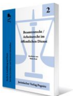
Beamtenrecht / Arbeitsrecht im öffentlichen Dienst Ladenpreis: 28,80EUR