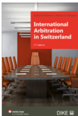
International Arbitration in Switzerland Ladenpreis: 47,00EUR