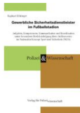
Gewerbliche Sicherheitsdienstleister im Fußballstadion Ladenpreis: 27,70EUR