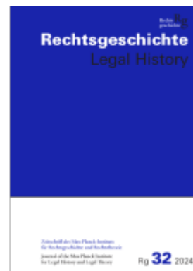
Rechtsgeschichte Legal History (RG). Zeitschrift des Max Planck-Instituts für Rechtsgeschichte und Rechtstheorie/Rechtsgeschichte Legal History Ladenpreis: 50,40EUR