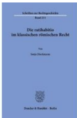
Die ratihabito im klassischen römischen Recht. Ladenpreis: 102,70EUR