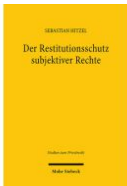
Der Restitutionschutz subjektiver Rechte Ladenpreis: 142,90EUR