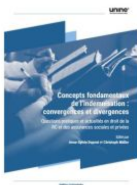
Concepts fondamentaux de l'indemnisation : convergences et divergences Ladenpreis: 72,00EUR