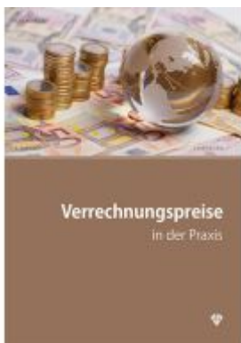
Verrechnungspreise in der Praxis Ladenpreis: 31,90EUR