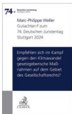
Verhandlungen des 74. Deutschen Juristentages Stuttgart 2024 Bd. I: Gutachten Teil F: Empfehlen sich im Kampf gegen den Klimawandel gesetzgeberische Maßnahmen auf dem Gebiet des Gesellschaftsrechts? Ladenpreis: 21,60EUR