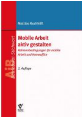
Mobile Arbeit aktiv gestalten Ladenpreis: 20,60EUR