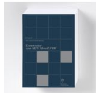
Kommentar zum MTV Metall NRW Ladenpreis: 149,10EUR