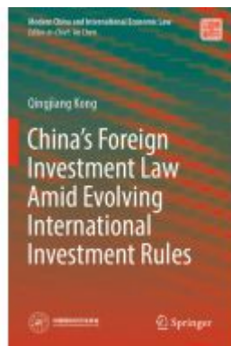
China's Foreign Investment Law Amid Evolving International Investment Rules Ladenpreis: 153,99EUR