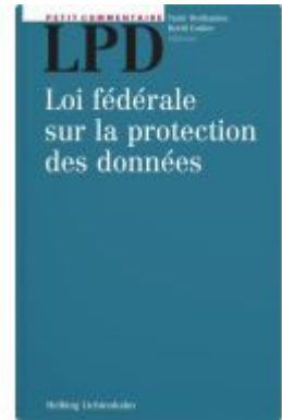
Petit commentaire LPD Ladenpreis: 218,00EUR