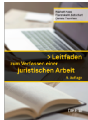
Leitfaden zum Verfassen einer juristischen Arbeit Ladenpreis: 50,00EUR