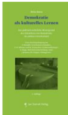
Demokratie als kulturelles Lernen Ladenpreis: 29,90EUR