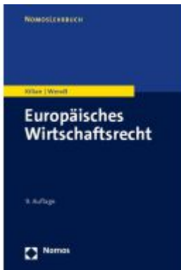
Europäisches Wirtschaftsrecht Ladenpreis: 33,90EUR

Wir haben andere Produkte gefunden, die Ihnen gefallen könnten!