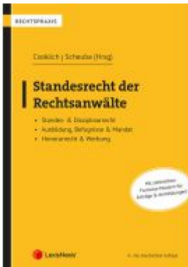
Standesrecht der Rechtsanwälte Ladenpreis: 64,00EUR