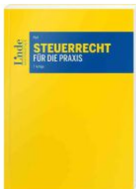
Steuerrecht für die Praxis Ladenpreis: 80,00EUR