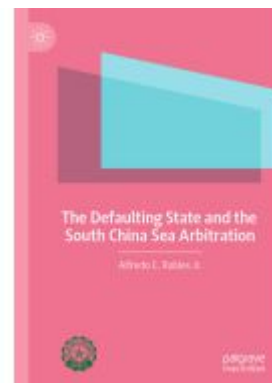
The Defaulting State and the South China Sea Arbitration Ladenpreis: 175,99EUR