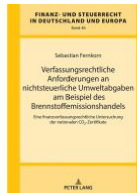
Verfassungsrechtliche Anforderungen an nichtsteuerliche Umweltabgaben am Beispiel des Brennstoffemissionshandels Ladenpreis: 44,45EUR