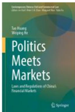
Politics Meets Markets Ladenpreis: 142,99EUR

Wir haben andere Produkte gefunden, die Ihnen gefallen könnten!