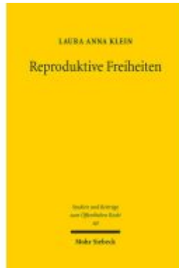
Reproduktive Freiheiten Ladenpreis: 101,80EUR