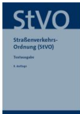
Straßenverkehrsordnung (StVO) Ladenpreis: 16,50EUR