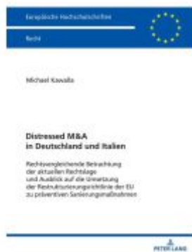
Distressed M&A in Deutschland und Italien Ladenpreis: 71,90EUR