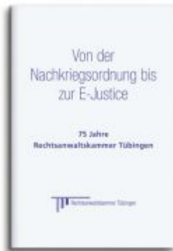
Von der Nachkriegsordnung bis zur E-Justice Ladenpreis: 41,20EUR