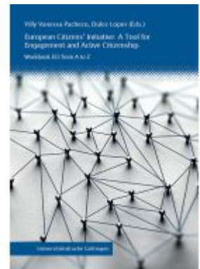
European Citizens' Initiative: A Tool for Engagement and Active Citizenship Ladenpreis: 32,90EUR