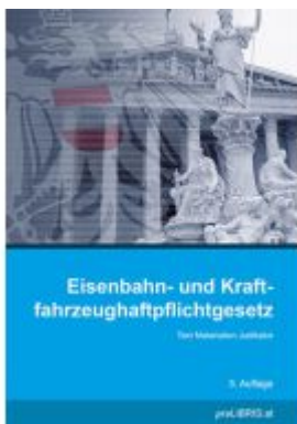
Eisenbahn- und Kraftfahrzeughaftpflichtgesetz Ladenpreis: 21,00EUR