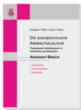
Assessor-Basics Die zivilrechtliche Anwaltsklausur Ladenpreis: 25,60EUR