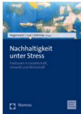
Nachhaltigkeit unter Stress Ladenpreis: 45,30EUR