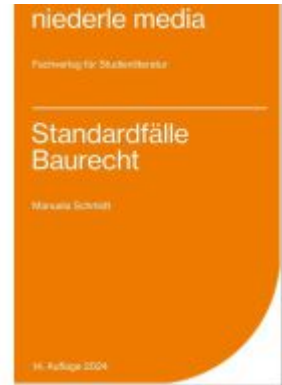
Standardfälle Baurecht - 2024 Ladenpreis: 15,40EUR