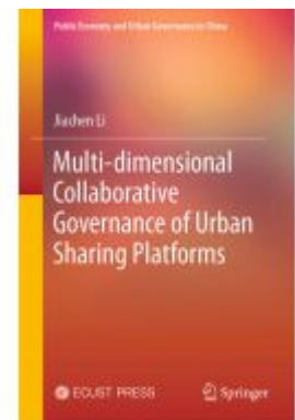
Multi-dimensional Collaborative Governance of Urban Sharing Platforms Ladenpreis: 142,99EUR