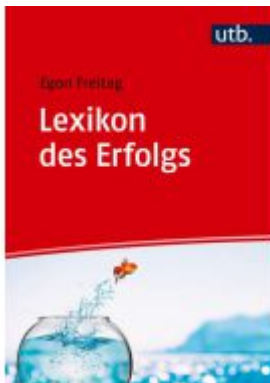
Lexikon des Erfolgs Ladenpreis: 51,30EUR

Wir haben andere Produkte gefunden, die Ihnen gefallen könnten!