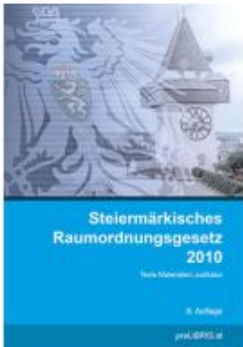
Steiermärkisches Raumordnungsgesetz 2010 Ladenpreis: 28,00EUR