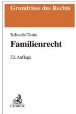
Familienrecht Ladenpreis: 33,90EUR