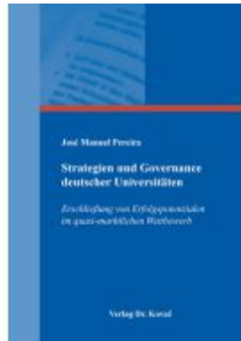
Strategien und Governance deutscher Universitäten Ladenpreis: 99,60EUR