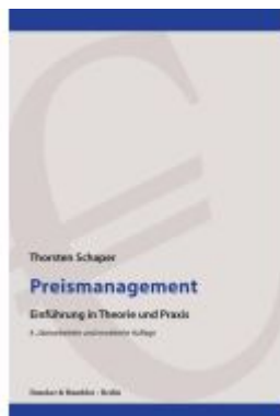
Preismanagement. Ladenpreis: 41,10EUR

Wir haben andere Produkte gefunden, die Ihnen gefallen könnten!