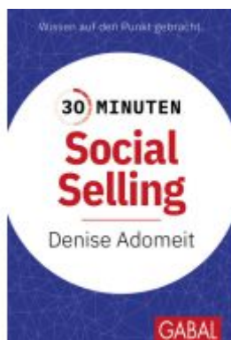
30 Minuten Social Selling Ladenpreis: 11,30EUR