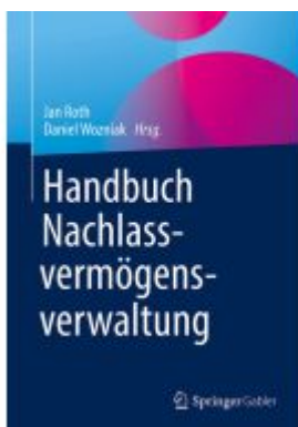
Handbuch Nachlassvermögensverwaltung Ladenpreis: 77,09EUR