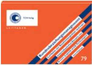
Kundenbeziehungsmanagement Ladenpreis: 257,10EUR