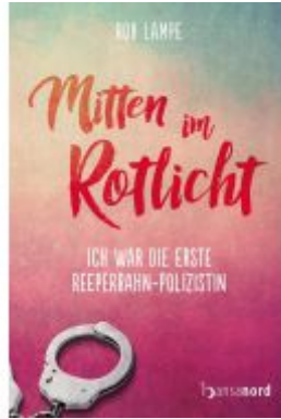
Mitten im Rotlicht