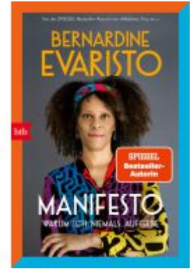
Manifesto. Warum ich niemals aufgebe