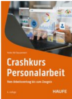
Crashkurs Personalarbeit Ladenpreis: 36,00EUR