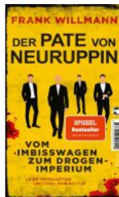
Der Pate von Neuruppin Ladenpreis: 12,40EUR