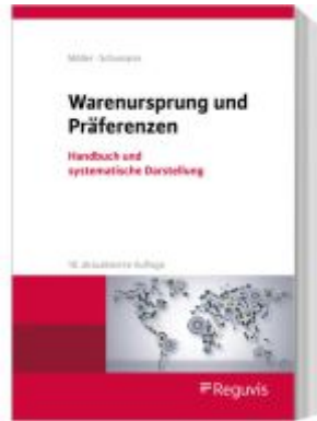
Warenursprung und Präferenzen Ladenpreis: 53,50EUR