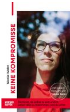
Keine Kompromisse Ladenpreis: 30,90EUR