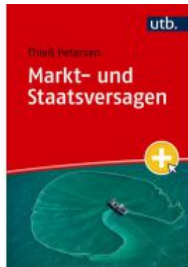
Markt- und Staatsversagen Ladenpreis: 23,60EUR