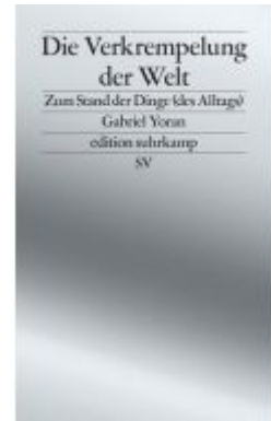
Die Verkümpelung der Welt Ladenpreis: 22,70EUR