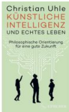
Künstliche Intelligenz und echtes Leben Ladenpreis: 24,70EUR