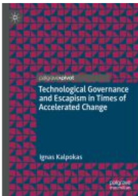
Technological Governance and Escapism in Times of Accelerated Change Ladenpreis: 49,49EUR

Wir haben andere Produkte gefunden, die Ihnen gefallen könnten!