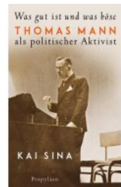
Was gut ist und was böse Ladenpreis: 24,70EUR