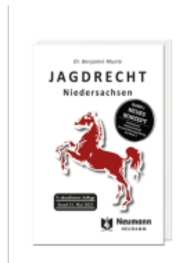
JAGDRECHT Niedersachsen Ladenpreis: 51,40EUR