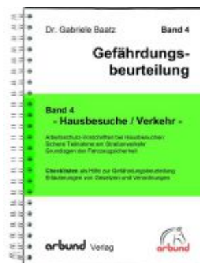
Band 4 - Gefährdungsbeurteilung "Hausbesuche / Verkehr" Ladenpreis: 118,30EUR