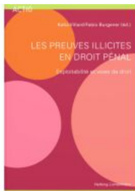
Les preuves illicites en droit pénal Ladenpreis: 75,00EUR