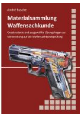
Materialsammlung zum Lehrbuch zur Waffensachkundeprüfung mit Übungsfragen zur Selbstkontrolle Ladenpreis: 12,20EUR