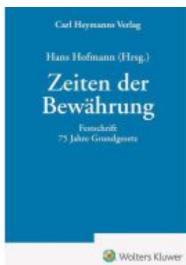
Zeiten der Bewährung - Festschrift 75 Jahre Grundgesetz Ladenpreis: 101,80EUR