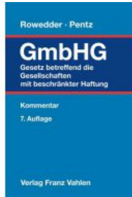
Gesetz betreffend die Gesellschaften mit beschränkter Haftung Ladenpreis: 297,10EUR