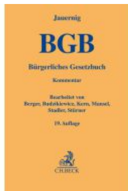
Bürgerliches Gesetzbuch Ladenpreis: 77,10EUR