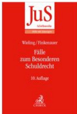
Fälle zum Besonderen Schuldrecht Ladenpreis: 29,80EUR

Wir haben andere Produkte gefunden, die Ihnen gefallen könnten!