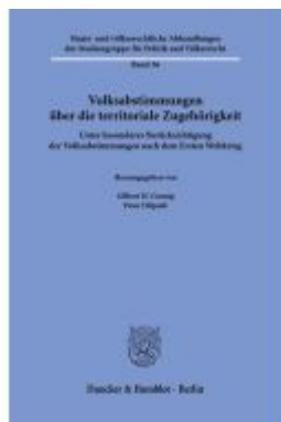
Volksabstimmungen über die territoriale Zugehörigkeit. Ladenpreis: 92,50EUR