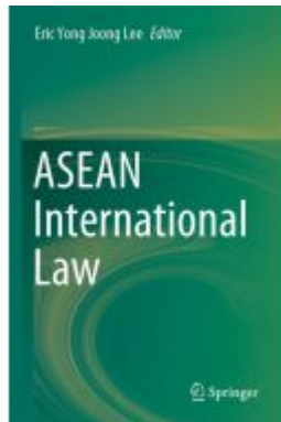
ASEAN International Law Ladenpreis: 219,99EUR