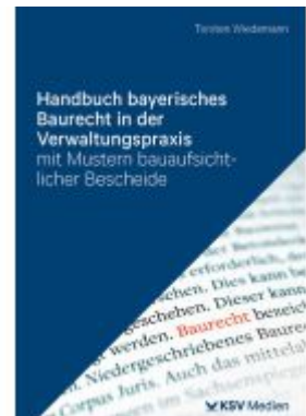
Handbuch bayerisches Baurecht in der Verwaltungspraxis Ladenpreis: 50,40EUR