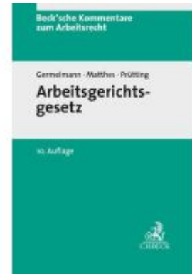
Arbeitsgerichtsgesetz Ladenpreis: 173,80EUR