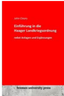
Einführung in die Haager Landkriegsordnung Ladenpreis: 30,80EUR