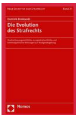
Die Evolution des Strafrechts