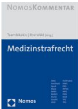
Medizinstrafrecht Ladenpreis: 153,20EUR

Wir haben andere Produkte gefunden, die Ihnen gefallen könnten!