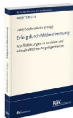
Erfolg durch Mitbestimmung Ladenpreis: 71,00EUR