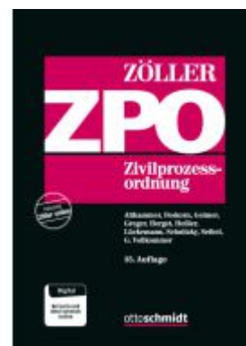
Zivilprozessordnung ZPO Ladenpreis: 184,10EUR