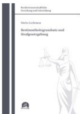
Bestimmtheitsgrundsatz und Strafgesetzgebung