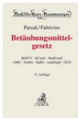
Betäubungsmittelgesetz Ladenpreis: 153,20EUR