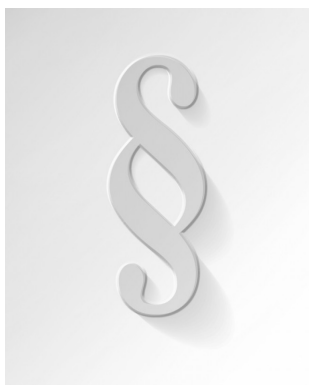
Das sogenannte Supervermächtnis