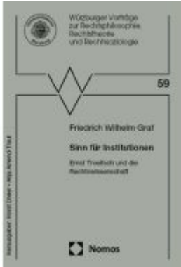
Sinn für Institutionen Ladenpreis: 40,10EUR