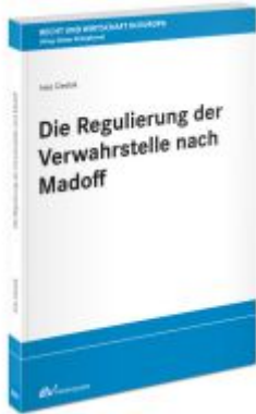
Die Regulierung der Verwahrstelle nach Madoff Ladenpreis: 91,50EUR