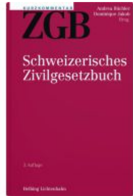
Kurzkomentar ZGB Ladenpreis: 361,00EUR