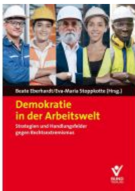
Demokratie in der Arbeitswelt Ladenpreis: 22,70EUR