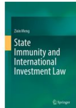
State Immunity and International Investment Law Ladenpreis: 142,99EUR