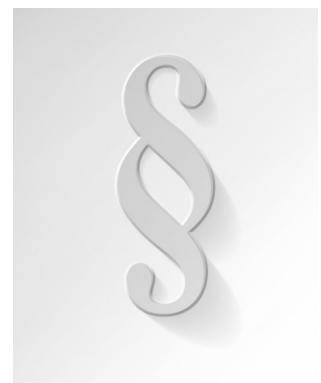
Deutsches Verfassungsrecht 1806 - 1918 Ladenpreis: 267,23EUR