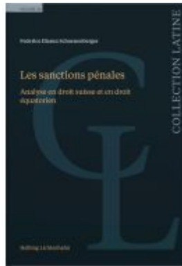
Les sanctions pénales Ladenpreis: 141,00EUR