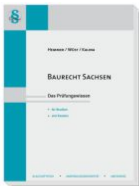
Baurecht Sachsen Ladenpreis: 25,60EUR

Wir haben andere Produkte gefunden, die Ihnen gefallen könnten!