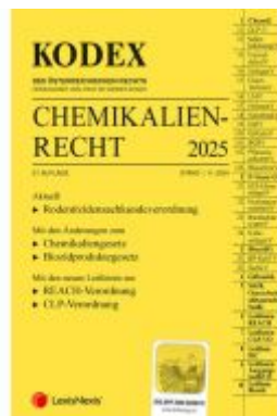
KODEX Chemikalienrecht 2025 - inkl. App Ladenpreis: 85,00EUR