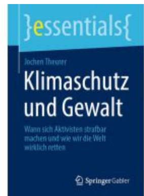
Klimaschutz und Gewalt