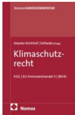
Klimaschutzrecht Ladenpreis: 153,20EUR