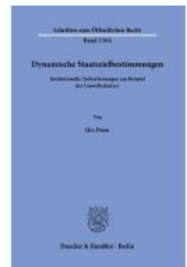
Dynamische Staatszielbestimmungen Ladenpreis: 82,20EUR