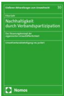
Nachhaltigkeit durch Verbandspartizipation