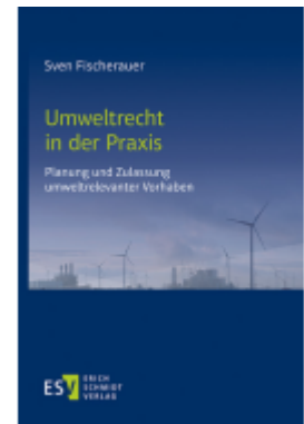
Umweltrecht in der Praxis Ladenpreis: 76,10EUR