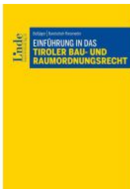
Einführung in das Tiroler Bau- und Raumordnungsrecht Ladenpreis: 49,00EUR