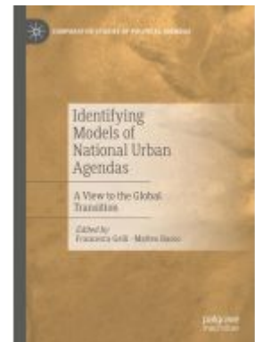
Identifying Models of National Urban Agendas Ladenpreis: 131,99EUR