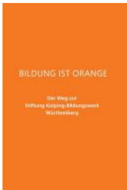
Bildung ist orange Ladenpreis: 24,70EUR