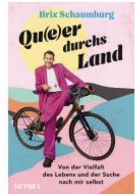
Qu(e)er durchs Land Ladenpreis: 16,50EUR