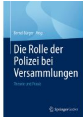
Die Rolle der Polizei bei Versammlungen Ladenpreis: 56,53EUR