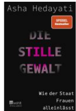
Die stille Gewalt Ladenpreis: 18,50EUR