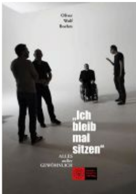
Ich bleib mal sitzen Ladenpreis: 18,50EUR