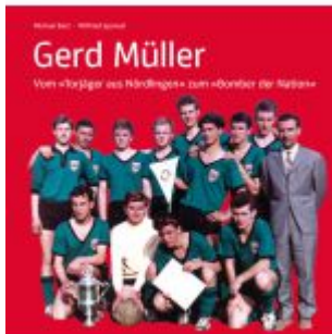
Gerd Müller Ladenpreis: 30,70EUR