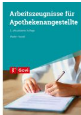
Arbeitszeugnisse für Apothekenangestellte Ladenpreis: 37,00EUR