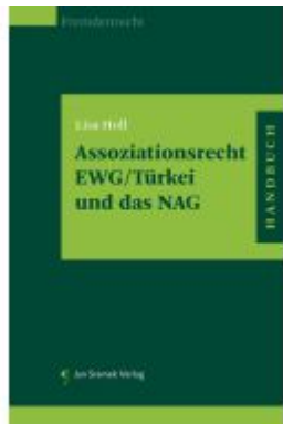
Assoziationsrecht EWG/Türkei und das NAG Ladenpreis: 78,00EUR