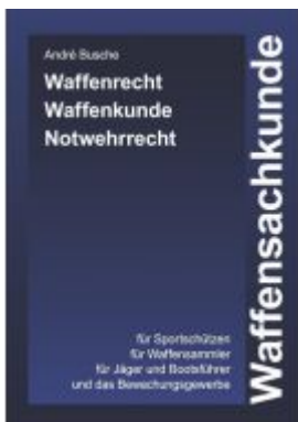
Waffensachkunde Ladenpreis: 30,70EUR

Wir haben andere Produkte gefunden, die Ihnen gefallen könnten!