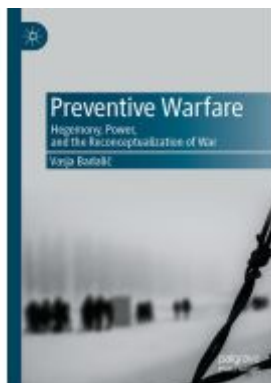
Preventive Warfare Ladenpreis: 120,99EUR