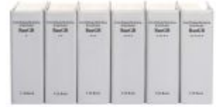
Baugesetzbuch Ladenpreis: 204,60EUR