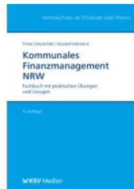
Kommunales Finanzmanagement NRW Ladenpreis: 45,30EUR