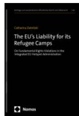
The EU's Liability for its Refugee Camps Ladenpreis: 137,80EUR