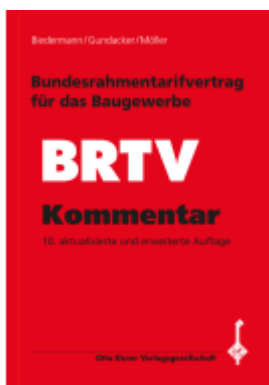
Bundesrahmentarifvertrag für das Baugewerbe (BRTV) / Kommentar Ladenpreis: 89,70EUR