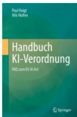
Handbuch KI-Verordnung Ladenpreis: 71,95EUR