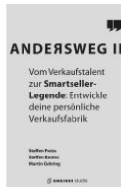
Andersweg II Ladenpreis: 30,90EUR