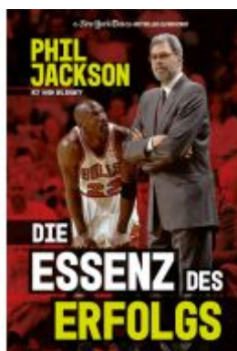
Die Essenz des Erfolgs Ladenpreis: 22,70EUR