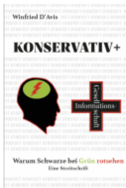
Konservativ+ Ladenpreis: 29,80EUR