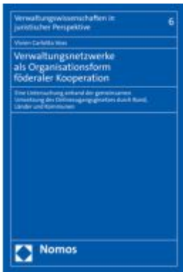
Administrationsnetzwerke als Organisationsform föderaler Kooperation Ladenpreis: 132,70EUR