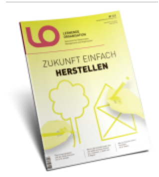
Zukunft einfach herstellen Ladenpreis: 28,99EUR