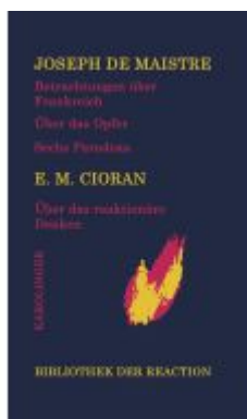
Betrachtungen über Frankreich/Über das Opfer/Sechs Paradoxa an die Marquise von Nav.../Über das reaktionäre Denken Ladenpreis: 33,00EUR