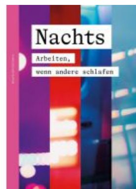
Nachts Ladenpreis: 12,40EUR