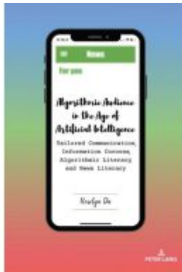
Algorithmic Audience in the Age of Artificial Intelligence Ladenpreis: 105,40EUR