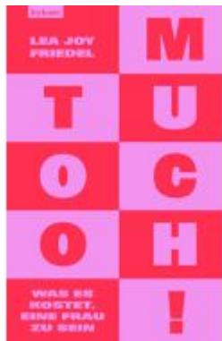
Too Much! Was es kostet, eine Frau zu sein Ladenpreis: 25,50EUR

Wir haben andere Produkte gefunden, die Ihnen gefallen könnten!