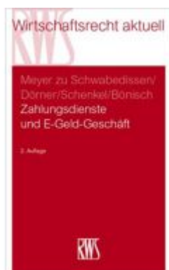
Zahlungsdienste und E-Geld-Geschäft