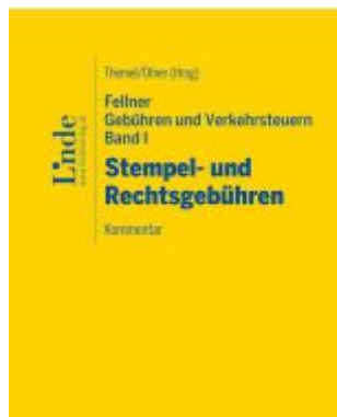
Fellner Gebühren und Verkehrssteuern, Band I: Stempel- und Rechtsgebühren Ladenpreis: 132,00EUR