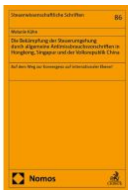
Die Bekämpfung der Steuerumgehung durch allgemeine Antimissbrauchsvorschriften in Hongkong, Singapur und der Volksrepublik China Ladenpreis: 132,70EUR