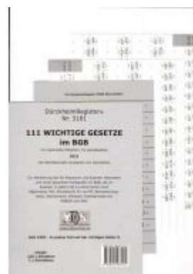
DürckheimRegister® BGB - 111 WICHTIGE §§ im BGB Ladenpreis: 18,50EUR