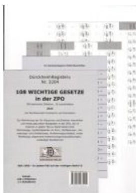
DürckheimRegister@ 108 WICHTIGE §§ in der ZPO, ohne Stichworte