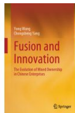
Fusion and Innovation Ladenpreis: 131,99EUR