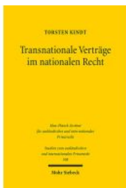
Transnationale Verträge im nationalen Recht