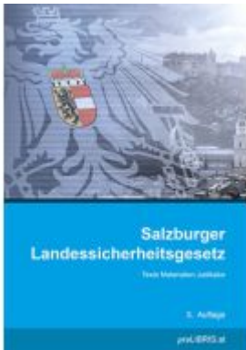
Salzburger Landessicherheitsgesetz Ladenpreis: 21,00EUR