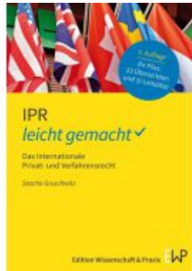
IPR – leicht gemacht. Ladenpreis: 16,40EUR