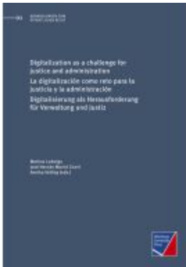
Digitalization as a challenge for justice and administration Ladenpreis: 26,60EUR