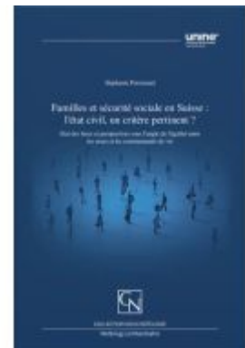
Familles et sécurité sociale en Suisse : l'état civil, un critère pertinent ? Ladenpreis: 218,00EUR