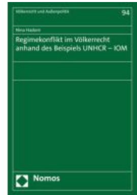
Regimekonflikt im Völkerrecht anhand des Beispiels UNHCR – IOM Ladenpreis: 96,70EUR