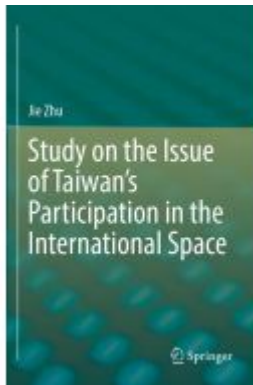
Study on the Issue of Taiwan's Participation in the International Space Ladenpreis: 109,99EUR