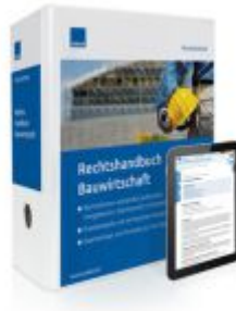
Rechtshandbuch Bauwirtschaft Ladenpreis: 239,80EUR