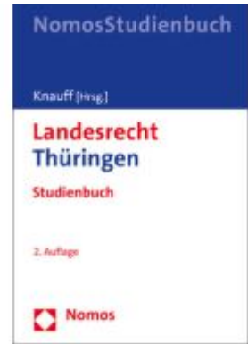
Landesrecht Thüringen Ladenpreis: 30,80EUR