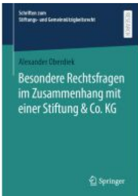
Besondere Rechtsfragen im Zusammenhang mit einer Stiftung & Co. KG Ladenpreis: 87,37EUR