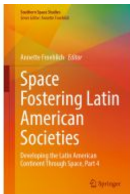
Space Fostering Latin American Societies Ladenpreis: 164,99EUR