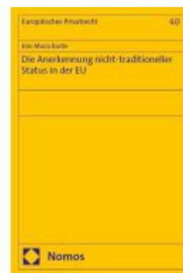
Die Anerkennung nicht-traditioneller Status in der EU Ladenpreis: 163,50EUR