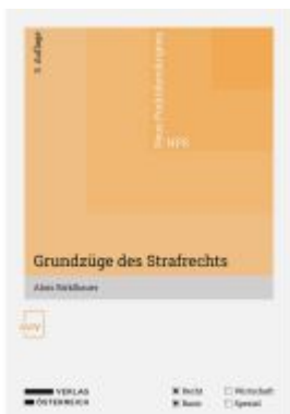
Grundzüge des Strafrechts Ladenpreis: 24,00EUR