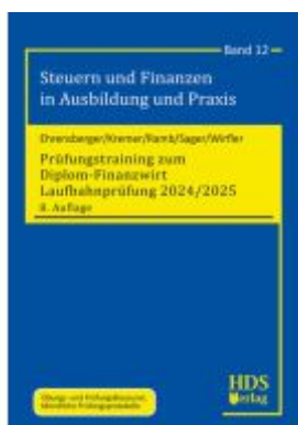
Prüfungstraining zum Diplom-Finanzwirt Laufbahnprüfung 2024/2025 Ladenpreis: 44,20EUR