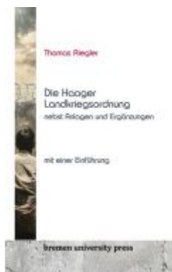
Die Haager Landkriegsordnung nebst Anlagen und Ergänzungen Ladenpreis: 20,50EUR