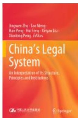
China's Legal System Ladenpreis: 153,99EUR