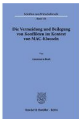
Die Vermeidung und Beilegung von Konflikten im Kontext von MAC-Klauseln. Ladenpreis: 92,50EUR