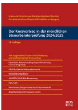
Der Kurzvortrag in der mündlichen Steuerberaterprüfung 2024/2025 Ladenpreis: 61,60EUR