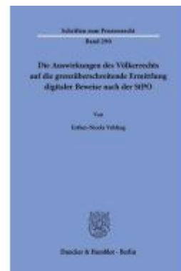
Die Auswirkungen des Völkerrechts auf die grenzüberschreitende Ermittlung digitaler Beweise nach der StPO. Ladenpreis: 92,50EUR