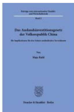
Das Auslandsinvestitionsgesetz der Volksrepublik China Ladenpreis: 102,70EUR