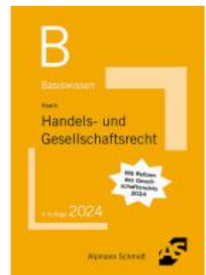
Basiswissen Handels- und Gesellschaftsrecht Ladenpreis: 13,30EUR