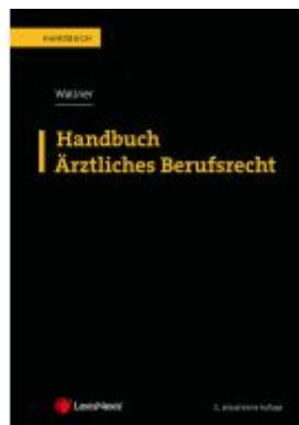
Handbuch Ärztliches Berufsrecht Ladenpreis: 89,00EUR