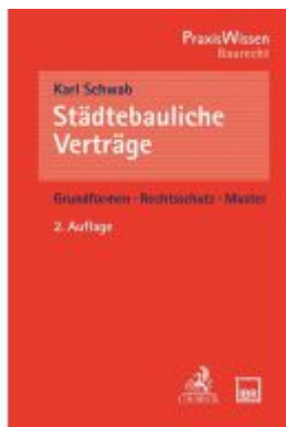
Städtebauliche Verträge Ladenpreis: 50,40EUR