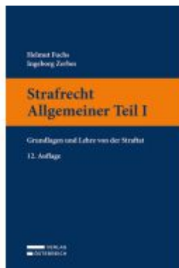
Strafrecht Allgemeiner Teil I Ladenpreis: 55,00EUR