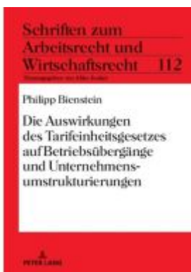
Die Auswirkungen des Tarifeinheitsgesetzes auf Betriebsübergänge und Unternehmensumstrukturierungen Ladenpreis: 71,90EUR