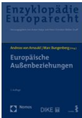
Europäische Außenbeziehungen Ladenpreis: 203,60EUR