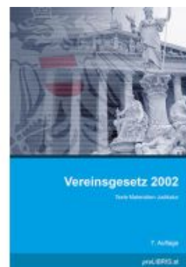
Vereinsgesetz 2002 Ladenpreis: 23,00EUR