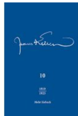
Hans Kelsen Werke Ladenpreis: 215,90EUR