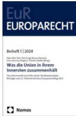
Was die Union in ihrem Innersten zusammenhält Ladenpreis: 60,70EUR