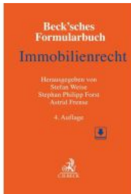
Beck'sches Formularbuch Immobilienrecht Ladenpreis: 173,80EUR