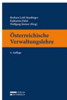
Österreichische Verwaltungslehre Ladenpreis: 49,00EUR