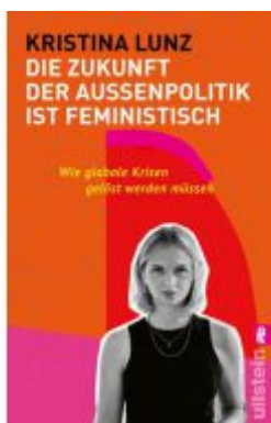
Die Zukunft der Außenpolitik ist feministisch Ladenpreis: 15,50EUR