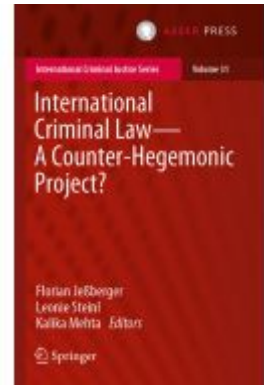
International Criminal Law—A Counter-Hegemonic Project? Ladenpreis: 164,99EUR