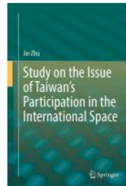
Study on the Issue of Taiwan's Participation in the International Space Ladenpreis: 109,99EUR