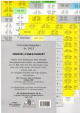
DürckheimRegister® IMMOBILIENFACHWIRT Ladenpreis: 28,50EUR