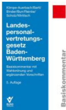
Landespersonalvertretungsgesetz Baden-Württemberg Ladenpreis: 60,70EUR

Wir haben andere Produkte gefunden, die Ihnen gefallen könnten!