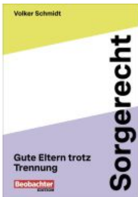
Sorgerecht Ladenpreis: 25,60EUR