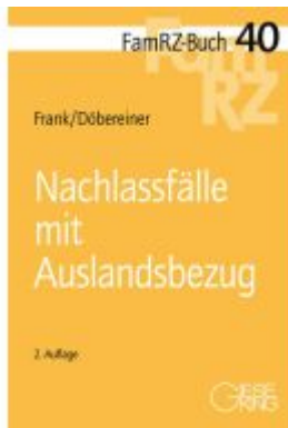
Nachlassfälle mit Auslandsbezug Ladenpreis: 71,00EUR