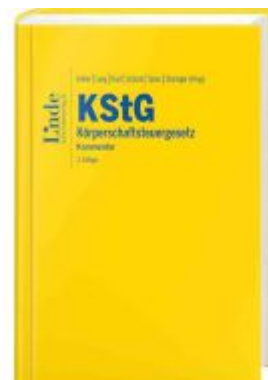
KStG | Körperschaftsteuergesetz Ladenpreis: 298,00EUR