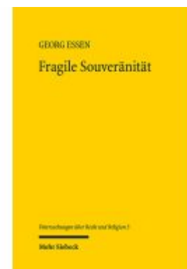
Fragile Souveränität Ladenpreis: 86,40EUR