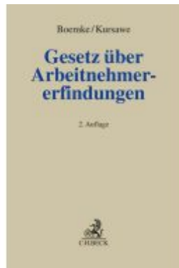
Gesetz über Arbeitnehmererfindungen Ladenpreis: 235,50EUR