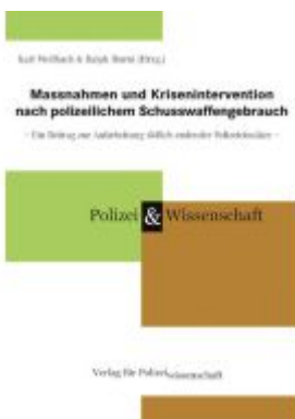
Massnahmen und Krisenintervention nach polizeilichem Schusswaffengebrauch Ladenpreis: 25,60EUR