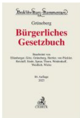
Bürgerliches Gesetzbuch Ladenpreis: 128,50EUR