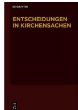
01.01.2020–30.06.2020 Ladenpreis: 209,00EUR