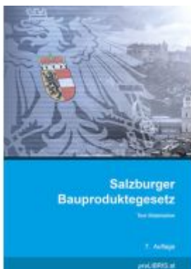
Salzburger Bauproduktengesetz Ladenpreis: 15,00EUR

Wir haben andere Produkte gefunden, die Ihnen gefallen könnten!