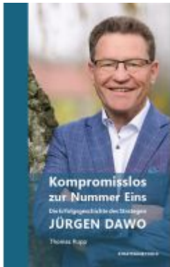
Kompromisslos zur Nummer Eins Ladenpreis: 25,60EUR