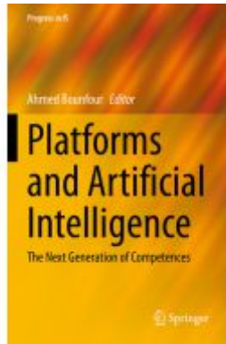
Platforms and Artificial Intelligence Ladenpreis: 142,99EUR