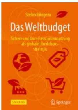
Das Weltbudget Ladenpreis: 28,78EUR