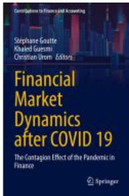
Financial Market Dynamics after COVID 19 Ladenpreis: 142,99EUR