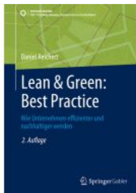
Lean & Green: Best Practice Ladenpreis: 41,11EUR