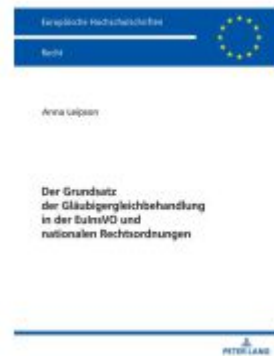
Der Grundsatz der Gläubigergleichbehandlung in der EuInsVO und nationalen Rechtsordnungen Ladenpreis: 51,40EUR