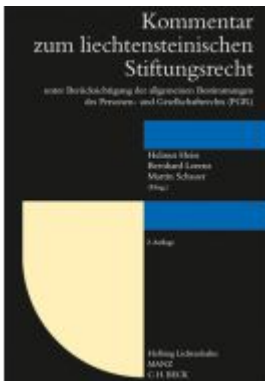
Kommentar zum liechtensteinischen Stiftungsrecht Ladenpreis: 348,00EUR