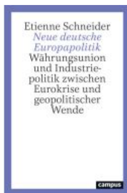
Neue deutsche Europapolitik Ladenpreis: 49,40EUR