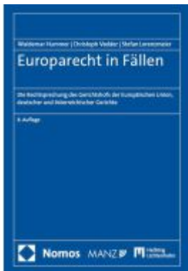
Europarecht in Fällen Ladenpreis: 41,10EUR

Wir haben andere Produkte gefunden, die Ihnen gefallen könnten!