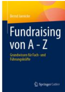
Fundraising von A - Z Ladenpreis: 56,53EUR