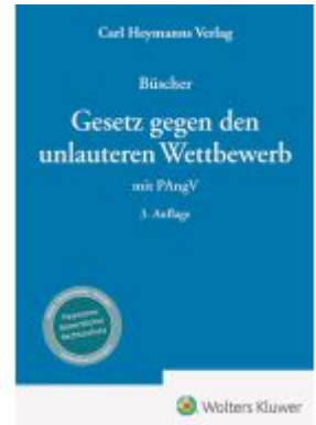
Gesetz gegen den unlauteren Wettbewerb Ladenpreis: 204,60EUR