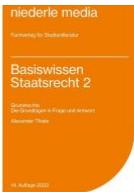
Basiswissen Staatsrecht 2 - 2023 Ladenpreis: 10,20EUR