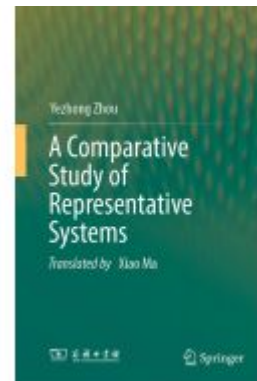
A Comparative Study of Representative Systems Ladenpreis: 175,99EUR