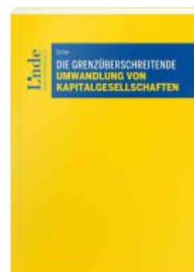
Die grenzüberschreitende Umwandlung von Kapitalgesellschaften Ladenpreis: 39,00EUR