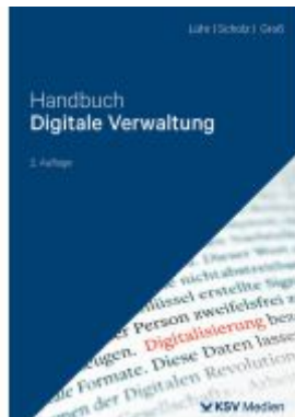
Handbuch Digitale Verwaltung Ladenpreis: 81,30EUR