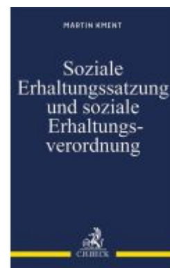
Soziale Erhaltungssatzung und soziale Erhaltungsverordnung Ladenpreis: 50,40EUR