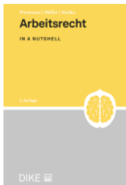
Arbeitsrecht Ladenpreis: 64,00EUR