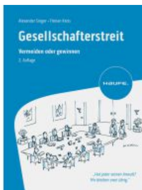
Gesellschafterstreit Ladenpreis: 92,60EUR