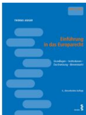
Einführung in das Europarecht Ladenpreis: 27,00EUR