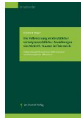
Die Vollstreckung strafrechtlicher vermögensrechtlicher Anordnungen von Nicht-EU-Staaten in Österreich Ladenpreis: 78,00EUR