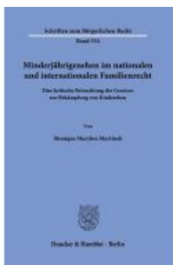
Minderjährigenehen im nationalen und internationalen Familienrecht. Ladenpreis: 113,00EUR