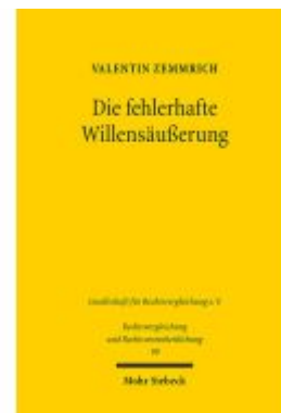
Die fehlerhafte Willensäußerung Ladenpreis: 86,40EUR