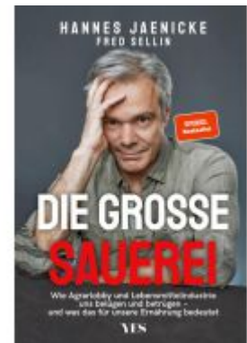
Die große Sauerei Ladenpreis: 25,70EUR