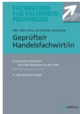
Geprüfte/r Handelsfachwirt/in Ladenpreis: 76,10EUR