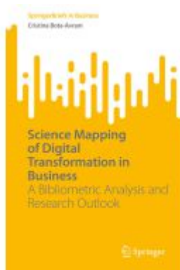
Science Mapping of Digital Transformation in Business Ladenpreis: 49,49EUR