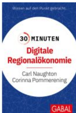
30 Minuten Digitale Regionalökonomie Ladenpreis: 11,30EUR