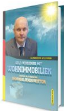
Geld verdienen mit Wohnimmobilien Ladenpreis: 39,90EUR