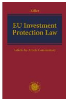
EU Investment Protection Law Ladenpreis: 257,10EUR