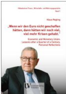
„Wenn wir den Euro nicht geschaffen hätten, dann hätten wir noch viel, viel mehr Krisen gehabt.“ Ladenpreis: 31,70EUR