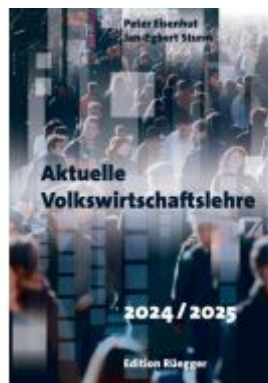
Aktuelle Volkswirtschaftslehre 2024/2025 Ladenpreis: 60,00EUR