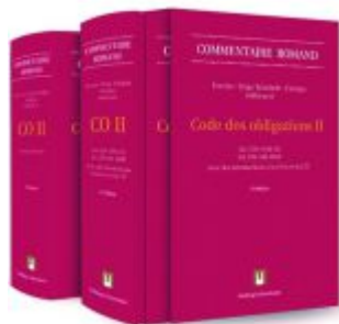
Code des obligations II (CO II) Ladenpreis: 878,00EUR