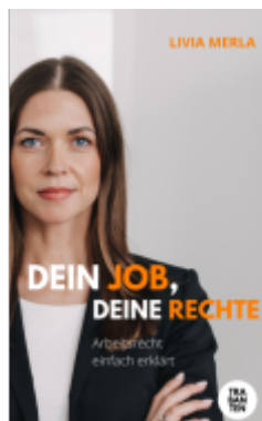
Dein Job, deine Rechte Ladenpreis: 16,90EUR