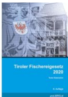
Tiroler Fischereigesetz 2020 Ladenpreis: 23,00EUR