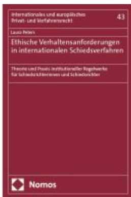
Ethische Verhaltensanforderungen in internationalen Schiedsverfahren Ladenpreis: 117,20EUR