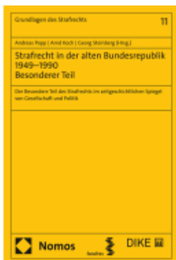
Strafrecht in der alten Bundesrepublik 1949-1990 Besonderer Teil Ladenpreis: 149,00EUR