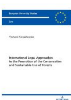
International Legal Approaches to the Promotion of the Conservation and Sustainable Use of Forests Ladenpreis: 87,30EUR