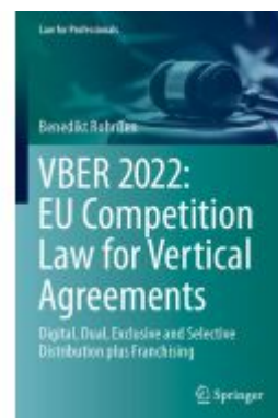
VBER 2022: EU Competition Law for Vertical Agreements Ladenpreis: 76,99EUR