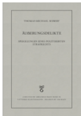
Äußerungsdelikte Ladenpreis: 91,50EUR