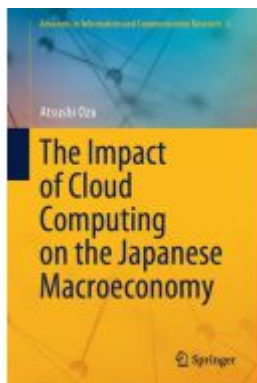
The Impact of Cloud Computing on the Japanese Macroeconomy Ladenpreis: 142,99EUR