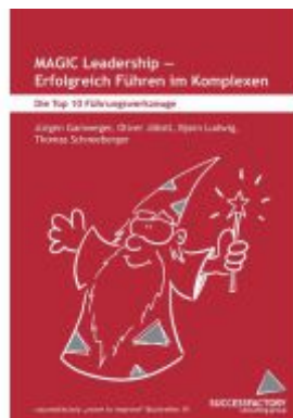
MAGIC Leadership - erfolgreich Führen im Komplexen Ladenpreis: 11,20EUR