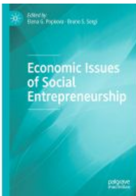
Economic Issues of Social Entrepreneurship Ladenpreis: 175,99EUR