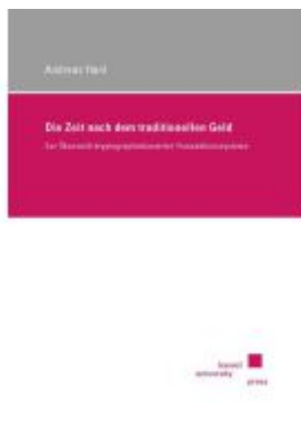
Die Zeit nach dem traditionellen Geld Ladenpreis: 40,10EUR