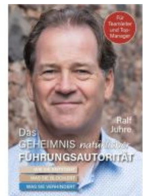
Das Geheimnis natürlicher Führungsautorität Ladenpreis: 20,60EUR