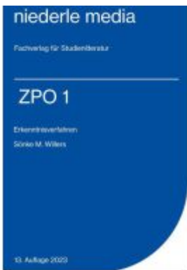
ZPO I Erkenntnisverfahren - 2023 Ladenpreis: 13,30EUR