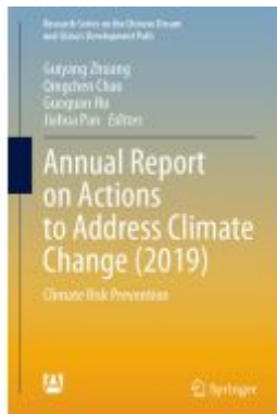
Annual Report on Actions to Address Climate Change (2019) Ladenpreis: 241,99EUR