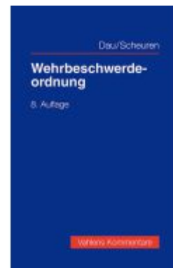
Wehrbeschwerdeordnung Ladenpreis: 132,70EUR