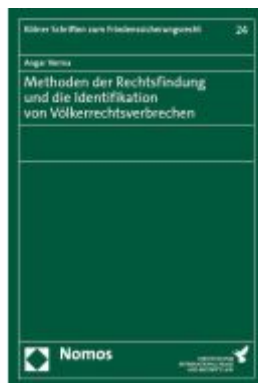
Methoden der Rechtsfindung und die Identifikation von Völkerrechtsverbrechen Ladenpreis: 86,40EUR