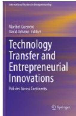
Technology Transfer and Entrepreneurial Innovations Ladenpreis: 186,99EUR