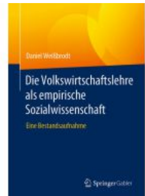
Die Volkswirtschaftslehre als empirische Sozialwissenschaft Ladenpreis: 46,25EUR