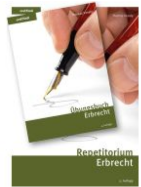
Erbrecht Kombipaket Ladenpreis: 76,10EUR