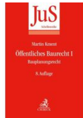
Öffentliches Baurecht I: Bauplanungsrecht Ladenpreis: 41,00EUR