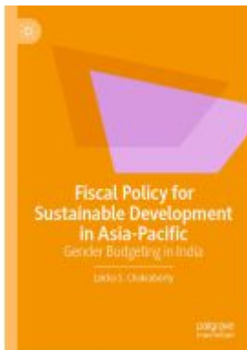
Fiscal Policy for Sustainable Development in Asia-Pacific Ladenpreis: 131,99EUR

Wir haben andere Produkte gefunden, die Ihnen gefallen könnten!