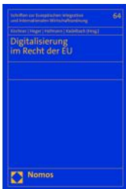
Digitalisierung im Recht der EU Ladenpreis: 76,10EUR