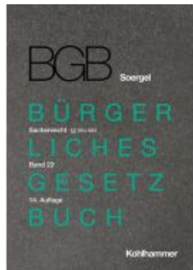
Kommentar zum Bürgerlichen Gesetzbuch mit Einführungsgesetz und Nebengesetzen (BGB) (Soergel) Ladenpreis: 627,00EUR