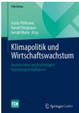
Klimapolitik und Wirtschaftswachstum Ladenpreis: 46,25EUR