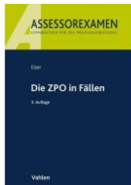
Die ZPO in Fällen Ladenpreis: 30,70EUR