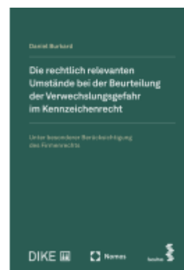
Die rechtlich relevanten Umstände bei der Beurteilung der Verwechslungsgefahr im Kennzeichenrecht Ladenpreis: 114,00EUR