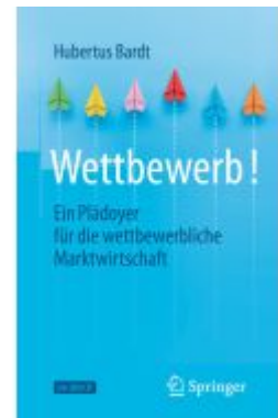
Wettbewerb! Ladenpreis: 20,55EUR