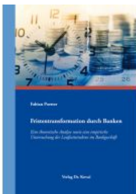
Fristentransformation durch Banken Ladenpreis: 91,40EUR