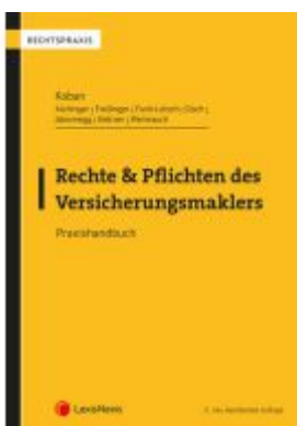
Rechte und Pflichten des Versicherungsmaklers Ladenpreis: 69,00EUR