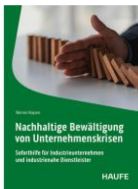
Nachhaltige Bewältigung von Unternehmenskrisen Ladenpreis: 61,70EUR