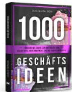
Das Buch der 1000 Geschäftsideen Ladenpreis: 19,90EUR