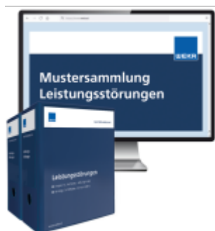
Mustersammlung Leistungsstörungen Ladenpreis: 261,80EUR

Wir haben andere Produkte gefunden, die Ihnen gefallen könnten!