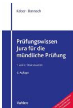
Prüfungswissen Jura für die mündliche Prüfung Ladenpreis: 20,40EUR