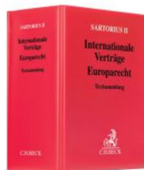
Internationale Verträge - Europarecht Ladenpreis: 40,10EUR