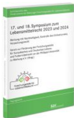
17. und 18. Symposium zum Lebensmittelrecht 2023 und 2024 Ladenpreis: 71,00EUR