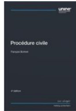
Procédure civile Ladenpreis: 98,00EUR