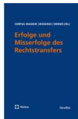
Erfolge und Misserfolge des Rechtstransfers Ladenpreis: 94,00EUR