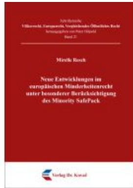
Neue Entwicklungen im europäischen Minderheitenrecht unter besonderer Berücksichtigung des Minority SafePack Ladenpreis: 78,00EUR