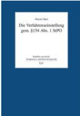
Die Verfahrenseinstellung gem. § 154 Abs. 1 StPO Ladenpreis: 39,90EUR