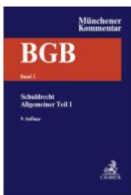
Münchener Kommentar zum Bürgerlichen Gesetzbuch Bd. 2: Schuldrecht - Allgemeiner Teil I Ladenpreis: 204,60EUR