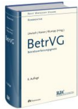
BetrVG Ladenpreis: 256,00EUR