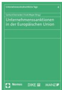
Unternehmenssanktionen in der Europäischen Union Ladenpreis: 65,80EUR