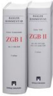
Basler Kommentar ZGB I + ZGB II Ladenpreis: 1.208,00EUR