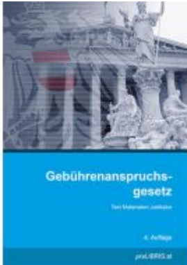
Gebührenanspruchsgesetz Ladenpreis: 25,00EUR