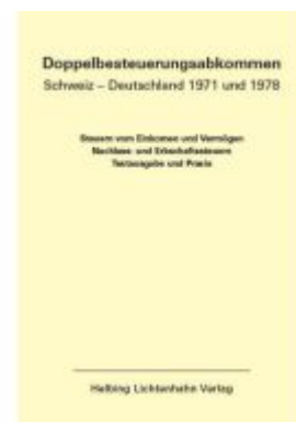
Doppelbesteuerungsabkommen Schweiz – Deutschland 1971 und 1978 EL 58 Ladenpreis: 185,00EUR