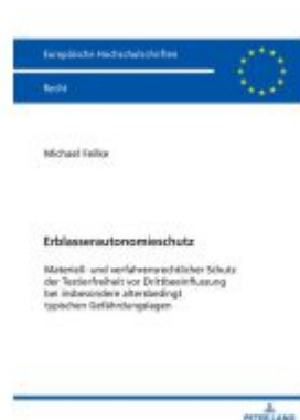
Erblasserautonomieschutz Ladenpreis: 71,90EUR