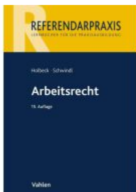
Arbeitsrecht Ladenpreis: 24,60EUR