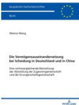
Die Vermögensauseinandersetzung bei Scheidung in Deutschland und in China Ladenpreis: 56,50EUR