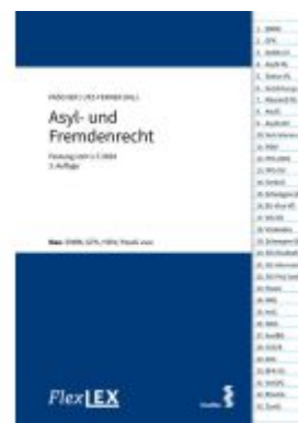
FlexLex Asyl- und Fremdenrecht Ladenpreis: 48,00EUR