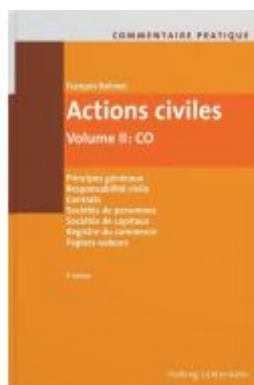
Commentaire pratique Actions civiles Ladenpreis: 240,00EUR