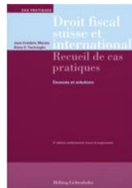
Droit fiscal suisse et international Ladenpreis: 86,00EUR