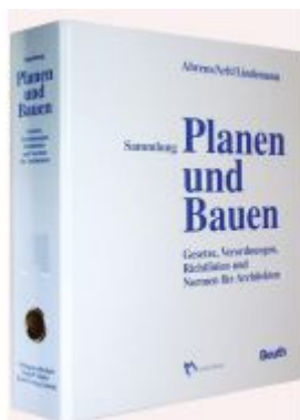
Sammlung Planen und Bauen Ladenpreis: 749,50EUR