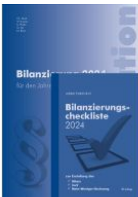
Kombi-Paket Bilanzierung 2024 Ladenpreis: 58,00EUR