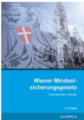
Wiener Mindestsicherungsgesetz Ladenpreis: 23,00EUR