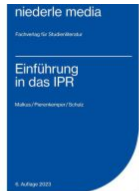
Einführung in das IPR - 2023 Ladenpreis: 15,40EUR