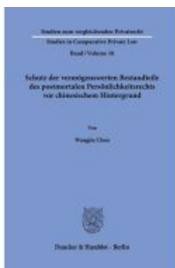
Schutz der vermögenswerten Bestandteile des postmortalen Persönlichkeitsrechts vor chinesischem Hintergrund. Ladenpreis: 71,90EUR