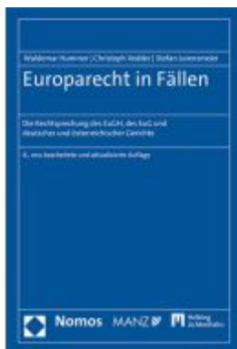
Europarecht in Fällen Ladenpreis: 41,00EUR