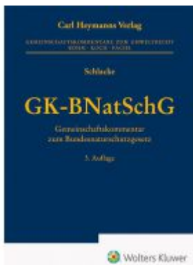
GK-BNatSchG Ladenpreis: 142,90EUR

Wir haben andere Produkte gefunden, die Ihnen gefallen könnten!