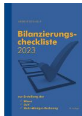
Bilanzierungscheckliste 2023 Ladenpreis: 14,85EUR