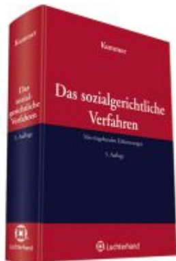
Das sozialgerichtliche Verfahren Ladenpreis: 122,40EUR