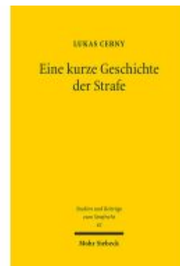
Eine kurze Geschichte der Strafe Ladenpreis: 86,40EUR