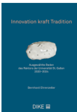
Innovation kraft Tradition Ladenpreis: 72,00EUR