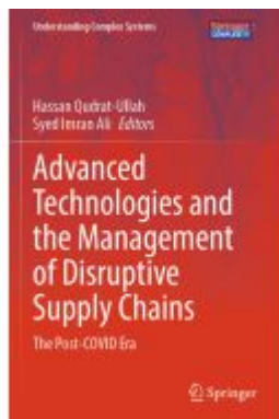
Advanced Technologies and the Management of Disruptive Supply Chains Ladenpreis: 109,99EUR