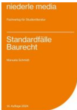
Standardfälle Baurecht - 2024 Ladenpreis: 15,40EUR

Wir haben andere Produkte gefunden, die Ihnen gefallen könnten!