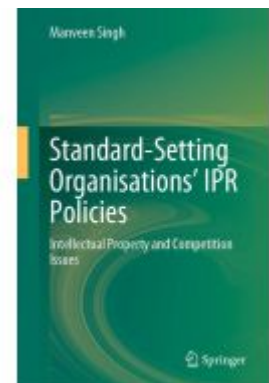
Standard-Setting Organisations' IPR Policies Ladenpreis: 153,99EUR