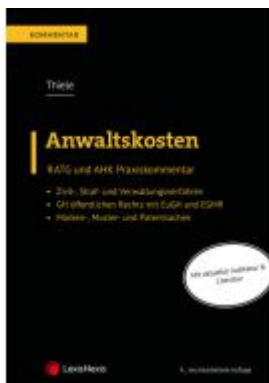
Anwaltskosten Ladenpreis: 139,00EUR