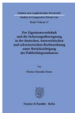
Der Eigentumsvorbehalt und die Sicherungsübereignung in der deutschen, österreichischen und schweizerischen Rechtsordnung unter Berücksichtigung des Publizitätsgrundsatzes Ladenpreis: 92,50EUR