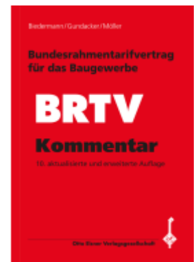
Bundesrahmentarifvertrag für das Baugewerbe (BRTV) / Kommentar Ladenpreis: 89,70EUR