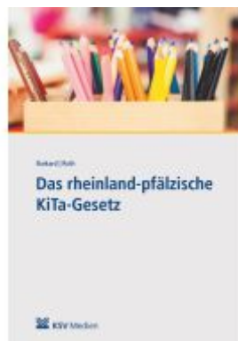
Das rheinland-pfälzische KiTa-Gesetz Ladenpreis: 40,10EUR