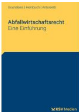
Abfallwirtschaftsrecht Ladenpreis: 30,90EUR

Wir haben andere Produkte gefunden, die Ihnen gefallen könnten!