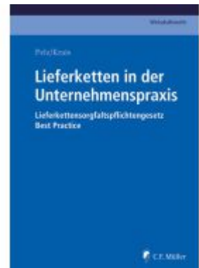
Lieferketten in der Unternehmenspraxis Ladenpreis: 71,00EUR