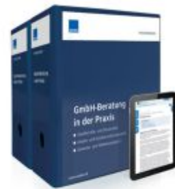
GmbH-Beratung in der Praxis Ladenpreis: 261,80EUR