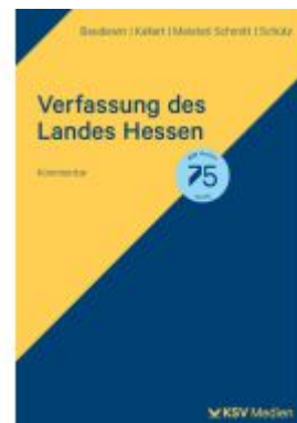
Verfassung des Landes Hessen Ladenpreis: 60,70EUR