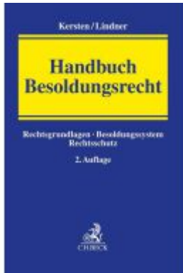
Handbuch Besoldungsrecht Ladenpreis: 132,70EUR