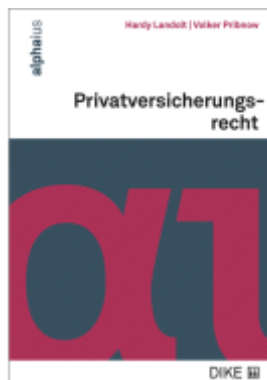
Privatversicherungsrecht Ladenpreis: 82,00EUR