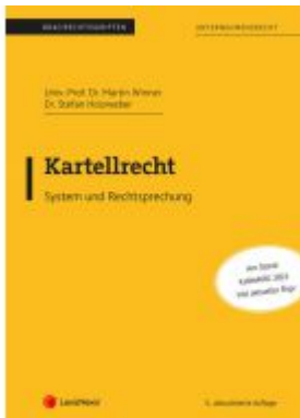
Kartellrecht (Skriptum) Ladenpreis: 27,50EUR