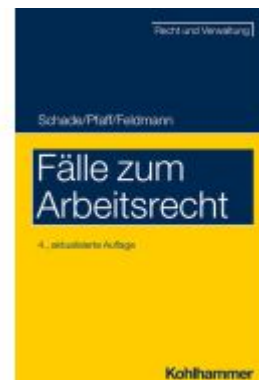
Fälle zum Arbeitsrecht Ladenpreis: 25,70EUR