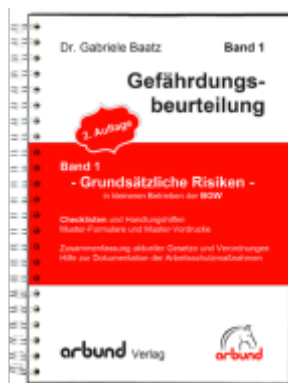
Band 1 - Gefährdungsbeurteilung "Grundsätzliche Risiken" Ladenpreis: 153,20EUR