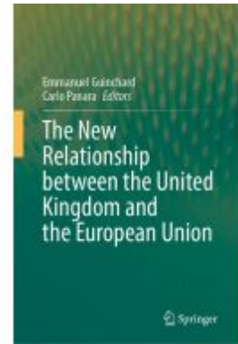
The New Relationship between the United Kingdom and the European Union Ladenpreis: 186,99EUR