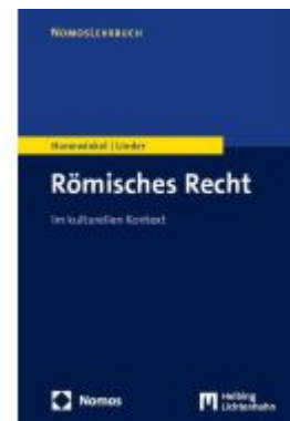
Römisches Recht Ladenpreis: 24,70EUR