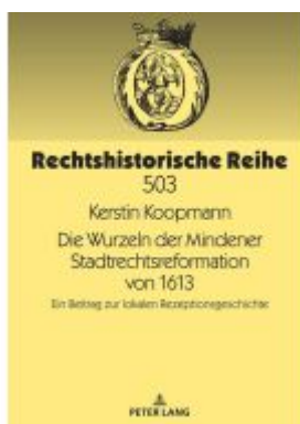
Die Wurzeln der Mindener Stadtrechtsreform von 1613 Ladenpreis: 92,50EUR