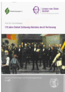
175 Jahre Einheit Schleswig-Holsteins durch Verfassung Ladenpreis: 15,40EUR