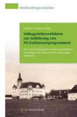
Volksgerichtsverfahren zur Aufklärung von NS Euthanasieprogrammen Ladenpreis: 59,90EUR