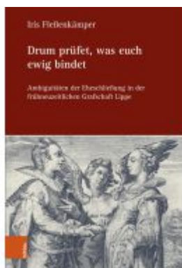
Drum prüfet, was euch ewig bindet Ladenpreis: 93,00EUR