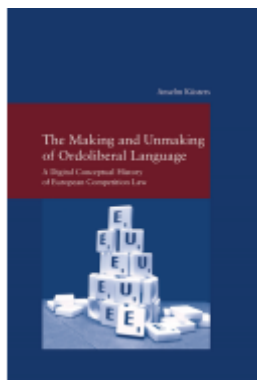
The Making and Unmaking of Ordoliberal Language Ladenpreis: 122,40EUR