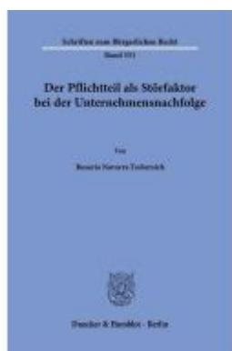
Der Pflichtteil als Störfaktor bei der Unternehmensnachfolge. Ladenpreis: 61,60EUR