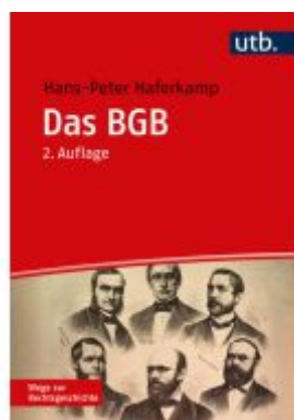
Das BGB Ladenpreis: 36,00EUR