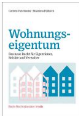
Wohnungseigentum Ladenpreis: 30,80EUR

Wir haben andere Produkte gefunden, die Ihnen gefallen könnten!