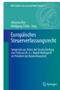
Europäisches Steuerfassungsrecht Ladenpreis: 113,07EUR