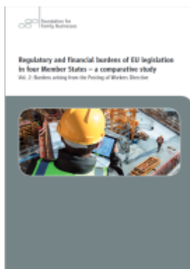
Regulatory and financial burdens of EU legislation in four Member States - a comparative study Ladenpreis: 30,80EUR