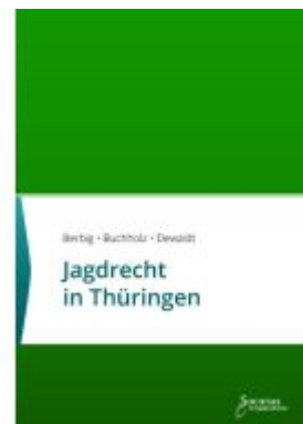
Jagdrecht in Thüringen Ladenpreis: 25,70EUR