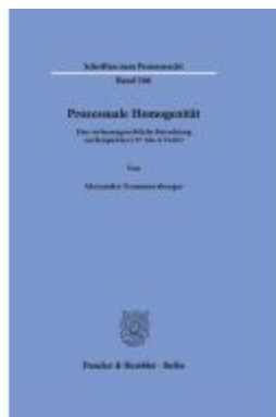
Prozessuale Homogenität Ladenpreis: 92,50EUR