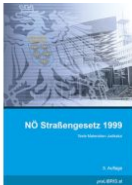
NÖ Straßengesetz 1999 Ladenpreis: 24,00EUR