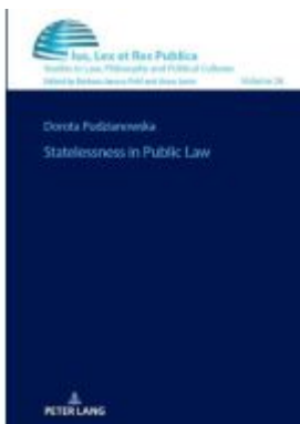
Statelessness in Public Law Ladenpreis: 61,60EUR