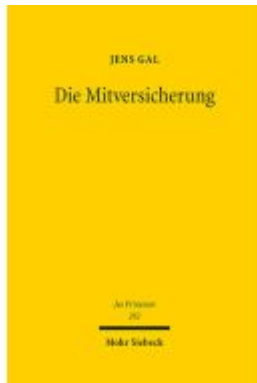
Die Mitversicherung Ladenpreis: 189,20EUR