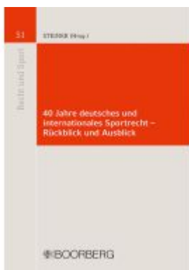
40 Jahre deutsches und internationales Sportrecht - Rückblick und Ausblick Ladenpreis: 30,70EUR