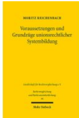
Voraussetzungen und Grundzüge unionsrechtlicher Systembildung Ladenpreis: 86,40EUR