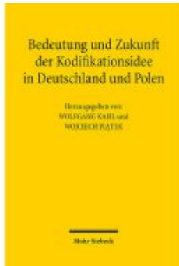
Bedeutung und Zukunft der Kodifikationsidee in Deutschland und Polen Ladenpreis: 60,70EUR