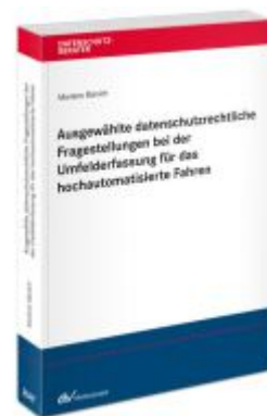
Ausgewählte datenschutzrechtliche Fragestellungen bei der Umfelderkennung für das hochautomatisierte Fahren Ladenpreis: 91,50EUR