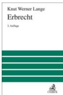
Erbrecht Ladenpreis: 153,20EUR