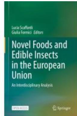
Novel Foods and Edible Insects in the European Union Ladenpreis: 54,99EUR