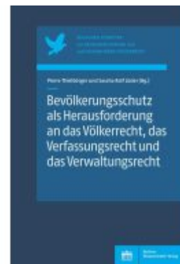
Bevölkerungsschutz als Herausforderung an das Völkerrecht, das Verfassungsrecht und das Verwaltungsrecht Ladenpreis: 32,90EUR