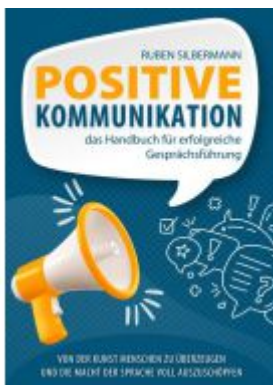
Positive Kommunikation - das Handbuch für erfolgreiche Gesprächsführung Ladenpreis: 16,40EUR