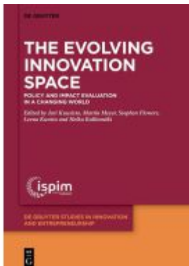
The Evolving Innovation Space Ladenpreis: 99,95EUR

Wir haben andere Produkte gefunden, die Ihnen gefallen könnten!