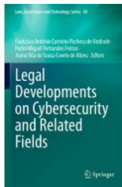
Legal Developments on Cybersecurity and Related Fields Ladenpreis: 175,99EUR