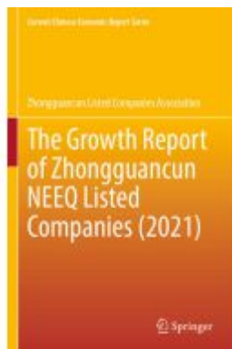
The Growth Report of Zhongguancun NEEQ Listed Companies (2021) Ladenpreis: 109,99EUR