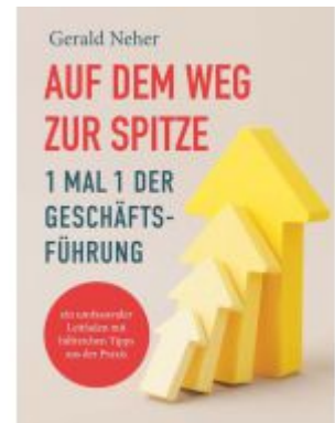
Auf dem Weg zur Spitze: 1 mal 1 der Geschäftsführung Ladenpreis: 41,30EUR