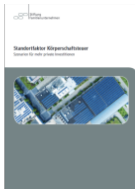
Standortfaktor Körperschaftsteuer Ladenpreis: 20,50EUR