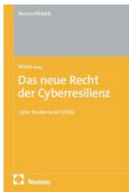
Das neue Recht der Cyberresilienz Ladenpreis: 40,10EUR