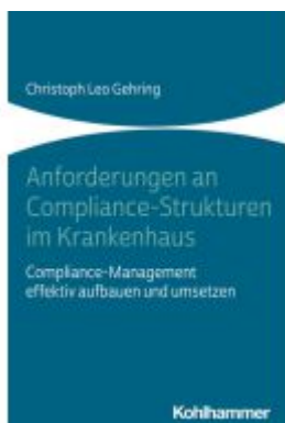
Anforderungen an Compliance-Strukturen im Krankenhaus Ladenpreis: 70,90EUR