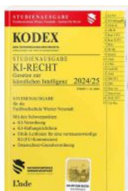
KODEX Studienausgabe KI-Recht 2024/25