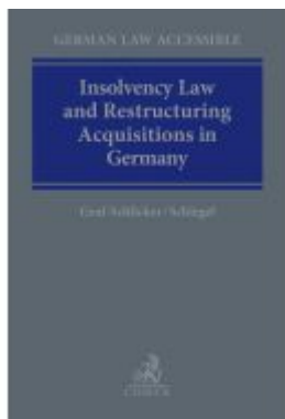
Insolvency Law & Restructuring in Germany Ladenpreis: 101,80EUR