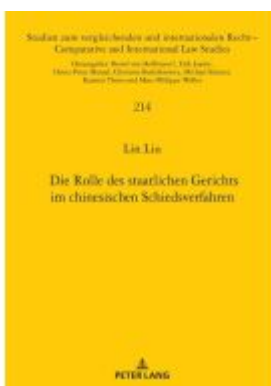
Die Rolle des staatlichen Gerichts im chinesischen Schiedsverfahren