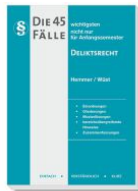
Die 45 wichtigsten Fälle Deliktsrecht Ladenpreis: 16,40EUR