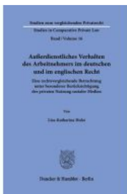
Außerdienstliches Verhalten des Arbeitnehmers im deutschen und im englischen Recht. Ladenpreis: 82,20EUR