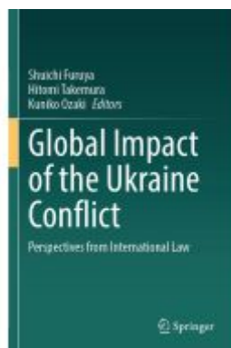
Global Impact of the Ukraine Conflict Ladenpreis: 164,99EUR