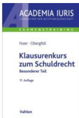
Klausurenkurs zum Schuldrecht Besonderer Teil Ladenpreis: 29,80EUR