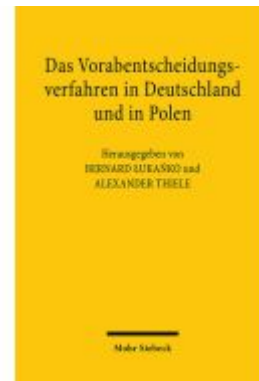
Das Vorabentscheidungsverfahren in Deutschland und in Polen Ladenpreis: 71,00EUR