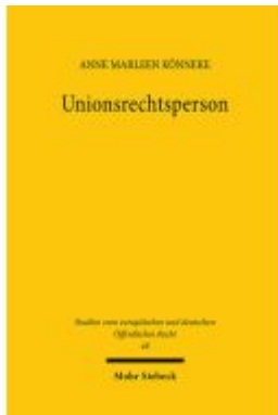
Unionsrechtsperson Ladenpreis: 96,70EUR