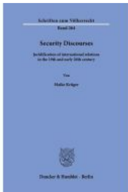
Security Discourses Ladenpreis: 92,50EUR

Wir haben andere Produkte gefunden, die Ihnen gefallen könnten!