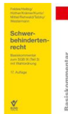
Schwerbehindertenrecht Ladenpreis: 55,60EUR