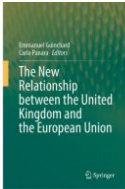
The New Relationship between the United Kingdom and the European Union Ladenpreis: 186,99EUR