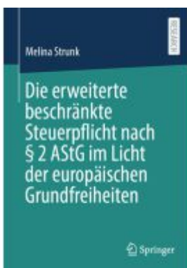
Die erweiterte beschränkte Steuerpflicht nach § 2 AStG im Licht der europäischen Grundfreiheiten Ladenpreis: 92,51EUR