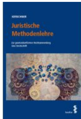
Juristische Methodenlehre Ladenpreis: 24,00EUR