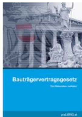
Bauträgervertragsgesetz Ladenpreis: 16,00EUR