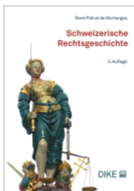
Schweizerische Rechtsgeschichte Ladenpreis: 96,00EUR