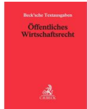
Öffentliches Wirtschaftsrecht Ladenpreis: 60,70EUR