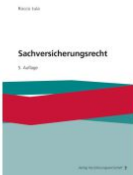
Sachversicherungsrecht Ladenpreis: 71,80EUR