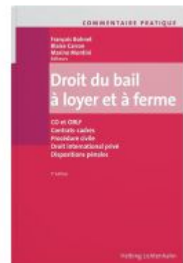
Commentaire pratique Droit du bail à loyer et à ferme Ladenpreis: 273,00EUR