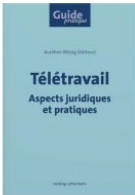
Télétravail Ladenpreis: 75,00EUR

Wir haben andere Produkte gefunden, die Ihnen gefallen könnten!