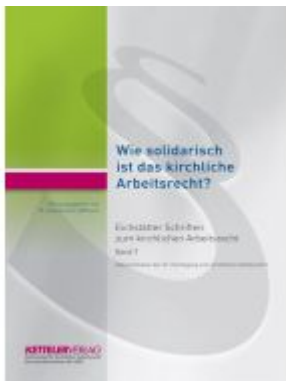
Eichstätter Schriften zum kirchlichen Arbeitsrecht 2022 Ladenpreis: 20,10EUR

Wir haben andere Produkte gefunden, die Ihnen gefallen könnten!