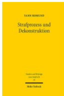
Strafprozess und Dekonstruktion Ladenpreis: 112,10EUR