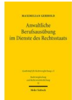
Anwaltliche Berufsausübung im Dienste des Rechtsstaats Ladenpreis: 132,70EUR