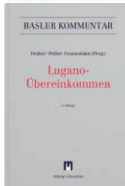
Lugano-Übereinkommen Ladenpreis: 416,00EUR