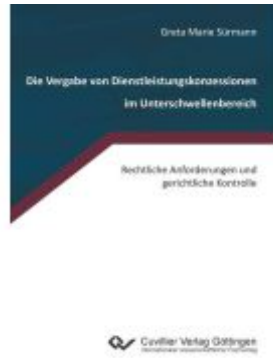
Die Vergabe von Dienstleistungskonzessionen im Unterschwellenbereich Ladenpreis: 92,50EUR