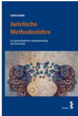
Juristische Methodenlehre Ladenpreis: 24,00EUR