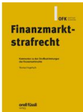
Finanzmarktstrafrecht Kommentar Ladenpreis: 183,00EUR