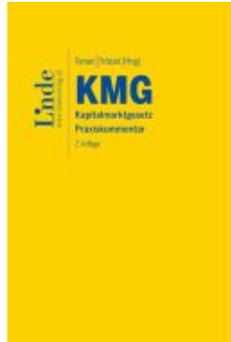
KMG | Kapitalmarktgesetz Ladenpreis: 89,00EUR