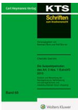
Die Suspektperioden des Art. 3 Abs. 1 EuInsVO 2015 Ladenpreis: 91,50EUR