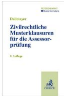
Zivilrechtliche Musterklausuren für die Assessorprüfung Ladenpreis: 28,70EUR