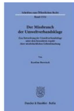
Der Missbrauch der Umweltverbandsklage Ladenpreis: 82,20EUR