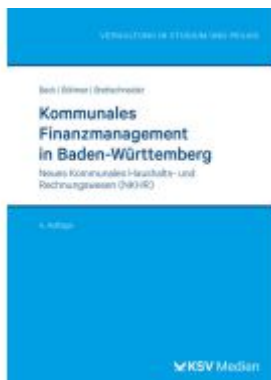
Kommunales Finanzmanagement in Baden-Württemberg Ladenpreis: 46,30EUR