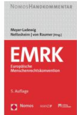
EMRK Europäische Menschenrechtskonvention Ladenpreis: 142,90EUR