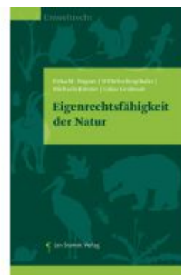
Eigenrechtsfähigkeit der Natur Ladenpreis: 55,00EUR