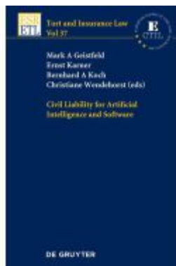
Civil Liability for Artificial Intelligence and Software Ladenpreis: 99,95EUR