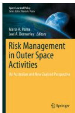
Risk Management in Outer Space Activities Ladenpreis: 153,99EUR