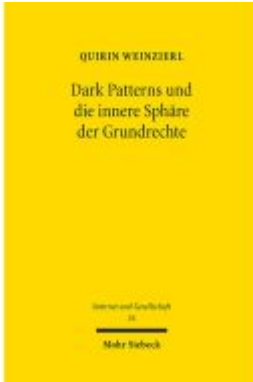
Dark Patterns und die innere Sphäre der Grundrechte Ladenpreis: 107,00EUR