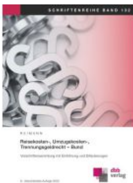
Reisekosten-, Umzugskosten-, Trennungsgeldrecht – Bund Ladenpreis: 30,80EUR