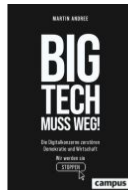
Big Tech muss weg! Ladenpreis: 25,70EUR