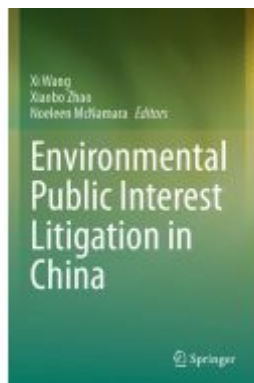
Environmental Public Interest Litigation in China Ladenpreis: 186,99EUR