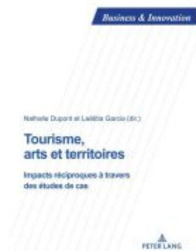
Tourisme, arts et territoires Ladenpreis: 55,00EUR