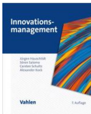
Innovationsmanagement Ladenpreis: 41,00EUR