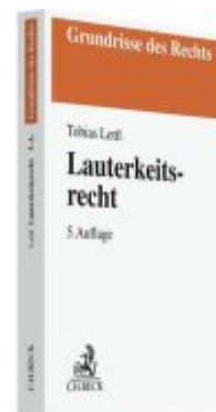
Lauterkeitsrecht Ladenpreis: 32,80EUR