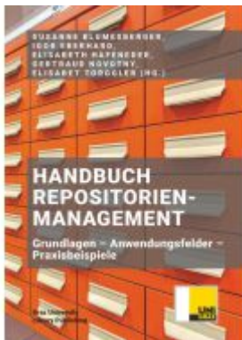
Handbuch Repositorienmanagement Ladenpreis: 40,00EUR

Wir haben andere Produkte gefunden, die Ihnen gefallen könnten!